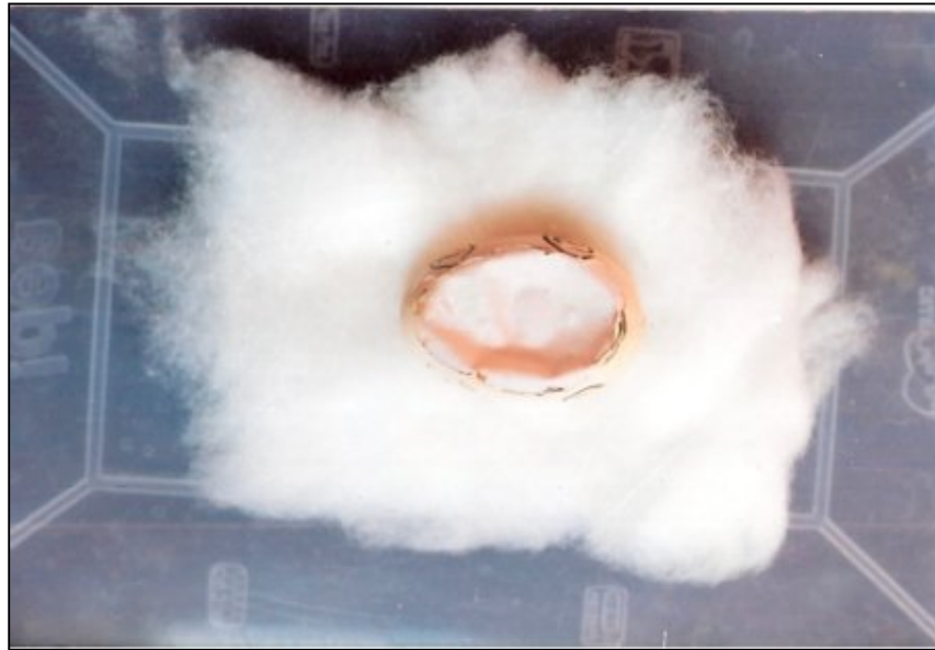
Figure 1.- One of the egg in the tray

Immediately after procurement the fertilized chick eggs (12 days old) were washed with water and kept on cotton surface already placed in a tray. The tray was kept in an incubator for 2 days at 37 \pm 0.5 °C. The eggs were rotated after every 2 hours (figure 1).