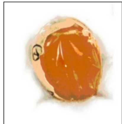
Figure 3.- The CAM of Hen's fertile egg

The exposed CAM was divided into four parts 1, 2, 3 and 4. These were written on the four sides. The preparations were applied on these spots as a drop in the following manner: Area 1: Multipurpose solution coded as MPS-2. Area 2: Sodium lauryl sulphate (SLS). Area 3: Baby shampoo (Johnson). Area 4: Propylene glycol (PG)