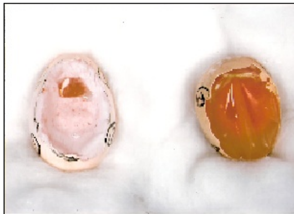
Figure 2.- The cracked egg shell.

This air space can be visualized before the egg is cracked by holding the egg under intense light. The eggs were cracked. The white part of the egg was removed carefully with the help of a pointed needle and a sharp blade in order to expose, once the opaque CAM-ISM dual layer is exposed, the irrigation with saline 0.9% will cause the dual layer to become translucent, allowing for visualization of the CAM vasculature as shown in (figure 3).